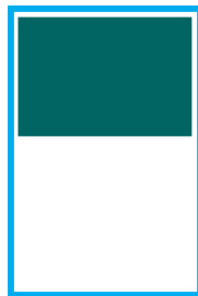
Half page 8" x 5"